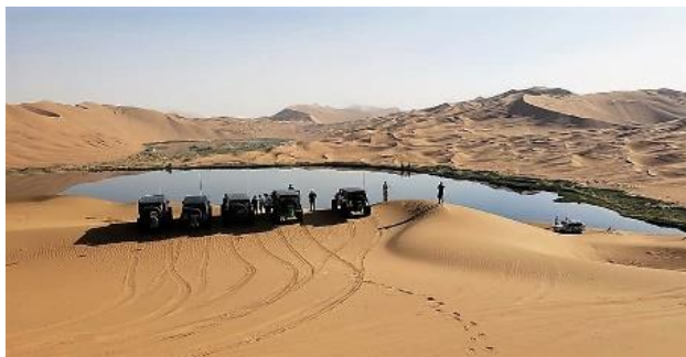
Pitstop in the Gobi Desert